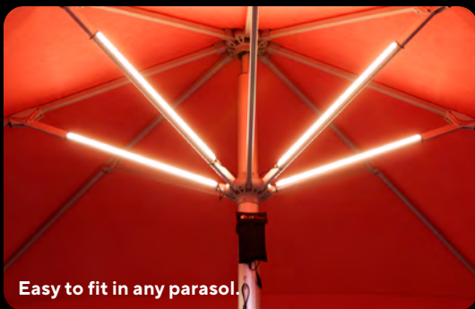
Easy to fit in any parasol.

Lume-1 ® smart fits almost any standard parasol. With the powerful battery, you are on the safe side every evening. Clever restaurateurs use it to conjure up cosiness and encourage your guests to spend time consuming. The remote control allows you to control brightness and colour selection in many levels by radio.