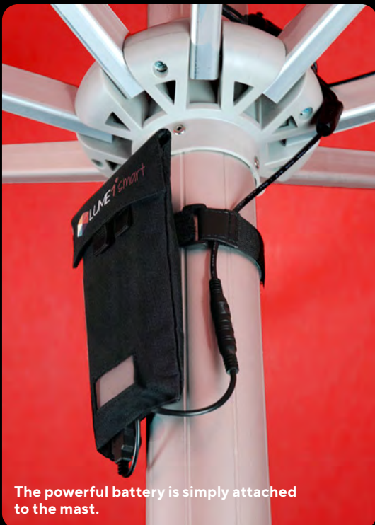
The powerful battery is simply attached to the mast.