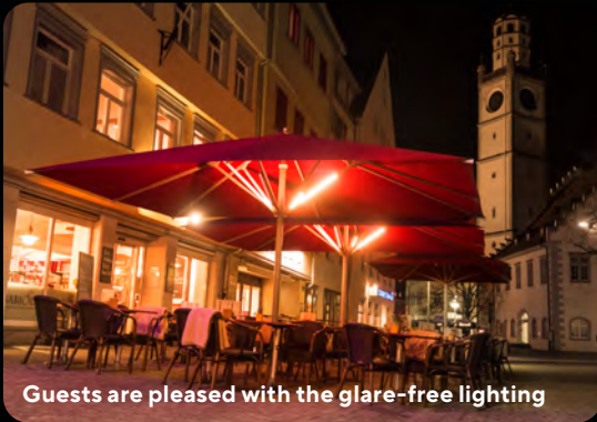
Guests are pleased with the glare-free lighting