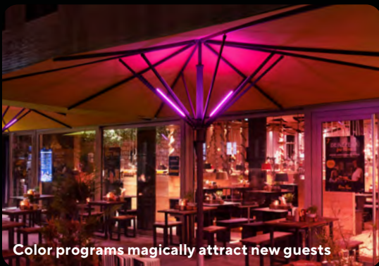
Color programs magically attract new guests

Assembly, handling, examples: Watch the video!